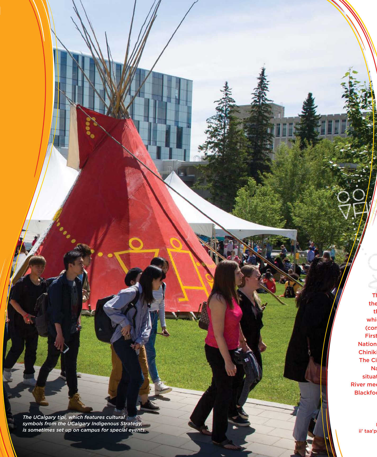
The UCalgary tipi, which features cultural symbols from the UCalgary Indigenous Strategy, is sometimes set up on campus for special events.

negha dágondíh je aa haanach'e welcome kwékwé óki tânisi âba wathtech dàní'tā-dà edlānete-a boozhoo tawnshi aba washded ki?su?k kvukvit