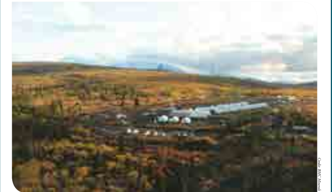
Kudz Ze Kayah , a phrase meaning caribou country in the Kaska language, is a copper, lead, zinc, gold, and silver project located in south-central Yukon. Read about what happened when a group of Environmental Monitoring students visited the site, and find out about the BMC Minerals Kaska Student Scholarship program... pages 7 and 8