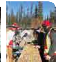
A new partnership program gives youth the opportunity to build strong foundations, literally ... page 3