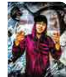
A youth-led project opens the door to difficult conversations about dropping out ... page 4